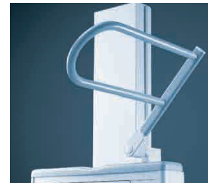
Overhead wall Bucky hand grip