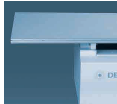
Carbon fiber tabletop