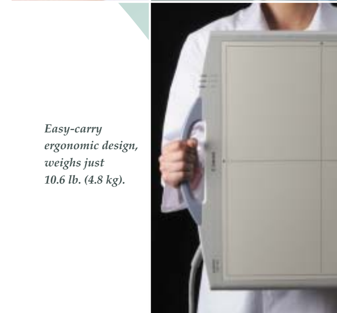
Easy-carry ergonomic design, weighs just 10.6 lb. (4.8 kg).